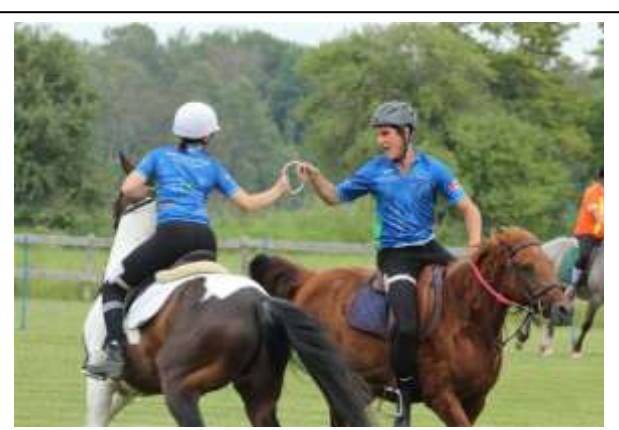
It's all about team work!!!!