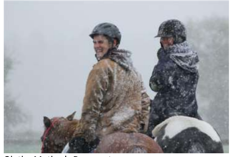
Oh the Mother's Day meet