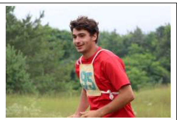
Pony Clubbers ... the only people I know who smile while running