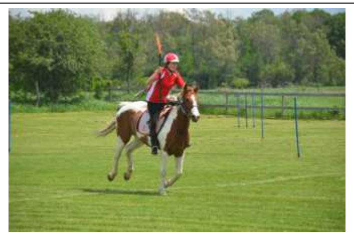
We are Canadian!!!! So when we run with sticks, they are always hockey sticks