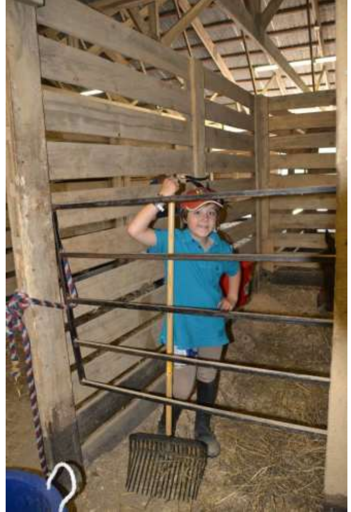
While it is not recommended in the manuals to lock members in the stall in order to do the mucking, it seems to be effective.