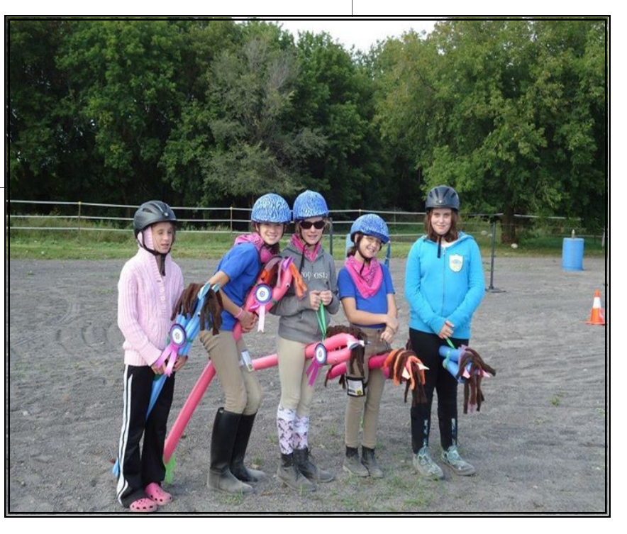
The CPC Quartermark was seen at a number of Regional Events this past summer